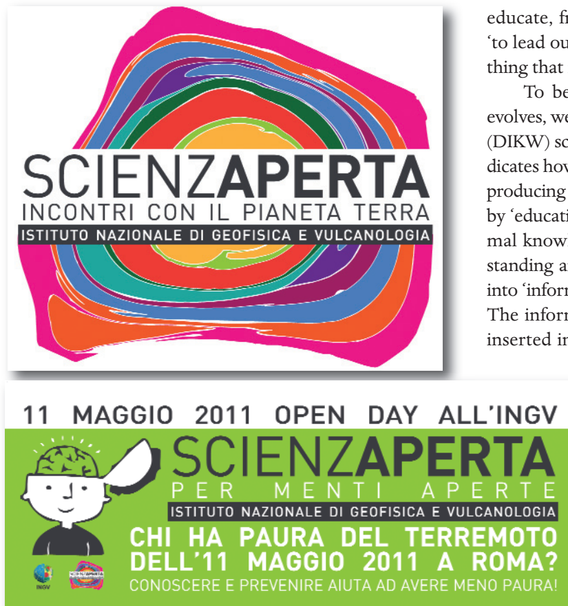
Figure 1 (above and previous page). Posters of the initiatives for the popularization of science from INGV.

To better understand how the knowledge process evolves, we use the data-information-knowledge-wisdom (DIKW) scheme [Wallace 2007, pp. 1-14], which clearly indicates how and when an educational process is capable of producing a social change (Figure 2). So what do we mean by 'education'? This is a process in which formal and informal knowledge are part of a system that guides understanding and action, in which the 'data' are transformed into 'information' only when they are correctly organized. The information then 'becomes' knowledge, when it is inserted into a context that gives meaning, and usually includes some relation to actions, or nonactions. And finally, the 'wisdom', which organizes the knowledge and is the result of the accumulated experience in our actions, or nonactions [Wisner 2006]. We can consider this itinerary as a useful theoretical reference framework upon which to base the education of the risk, or the 'risk education'. Risk education is a process that can affect the risk reduction itself, through explaining the life choices of individuals in relation to housing, based not only on technical knowledge, but also on emotive aspects.