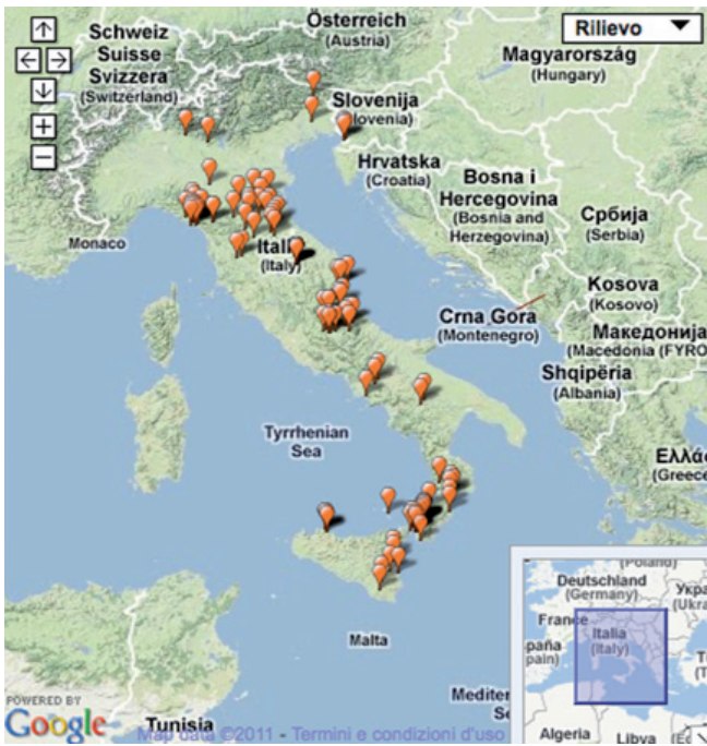
Figure 4. Geographical distribution of the schools involved in the EDURISK Project.

sities), and which maintains close ties of collaboration with professionals in the fields of educational planning and communication.