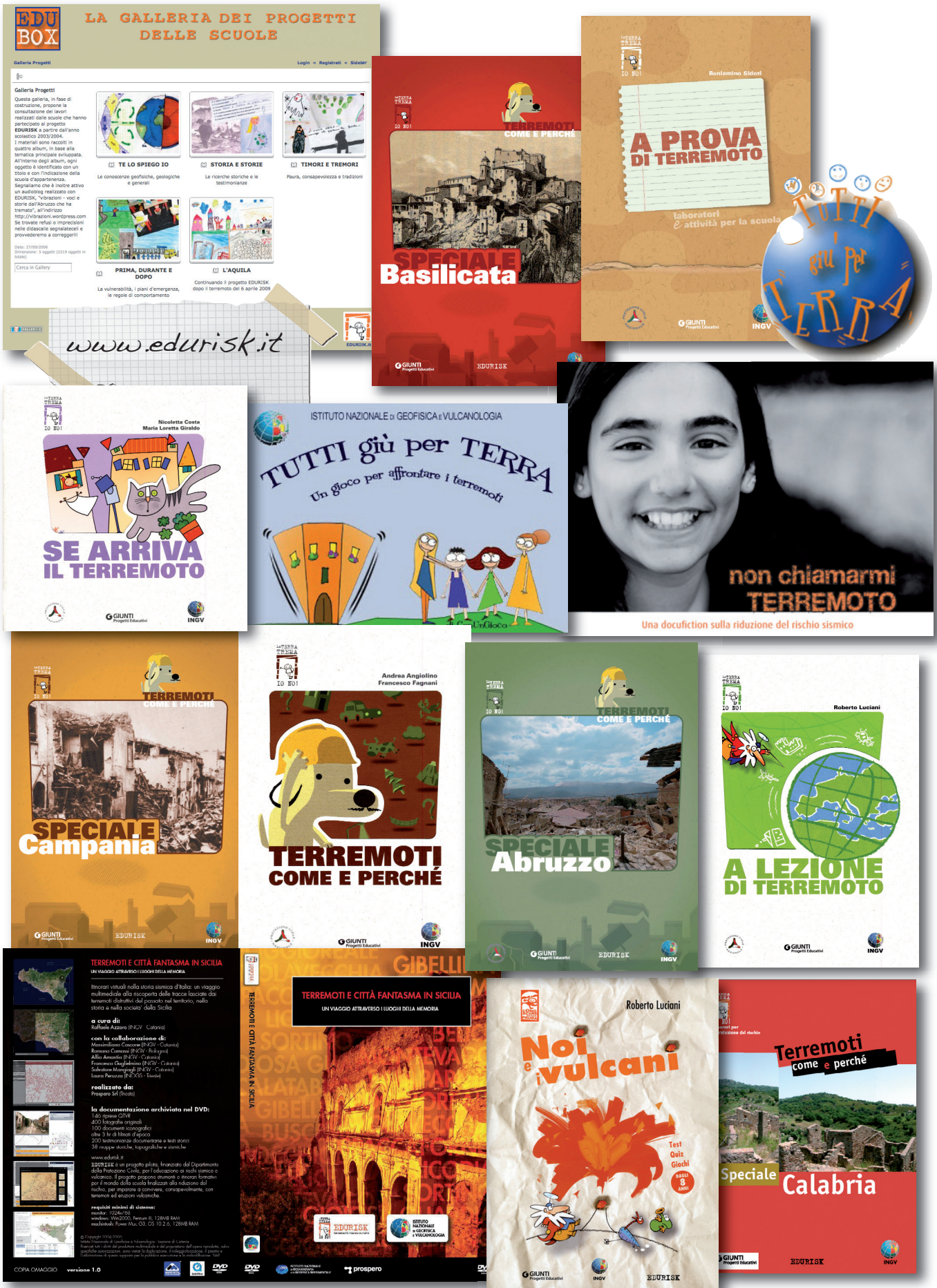
Figure 3. Instruments of the EDURISK Project.